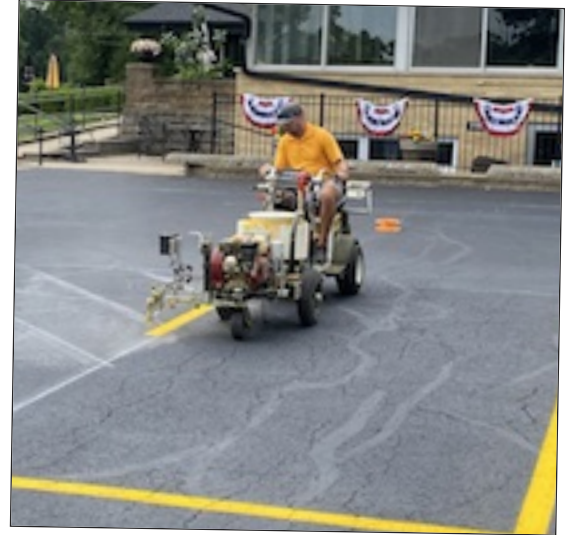
Above left, Lakeside Sealcoating workers seal the parking lot June 2. Above right, a workman from Effingham Striping Service paints parking lines. The work cost about $14,000 and so far members have donated $4,725 to cover the cost. Donations are still being taken.