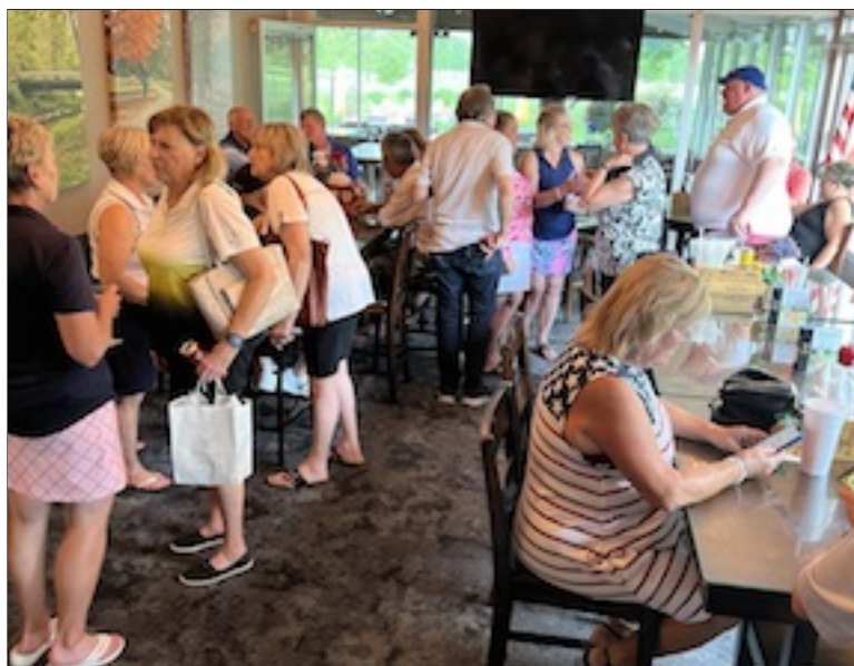
Above, contestants from the Sip 'n' Chip Par 3 tourney crowd the bar area following the event, which began with an optional shot on the patio and included two drink stations on the nine-hole course.