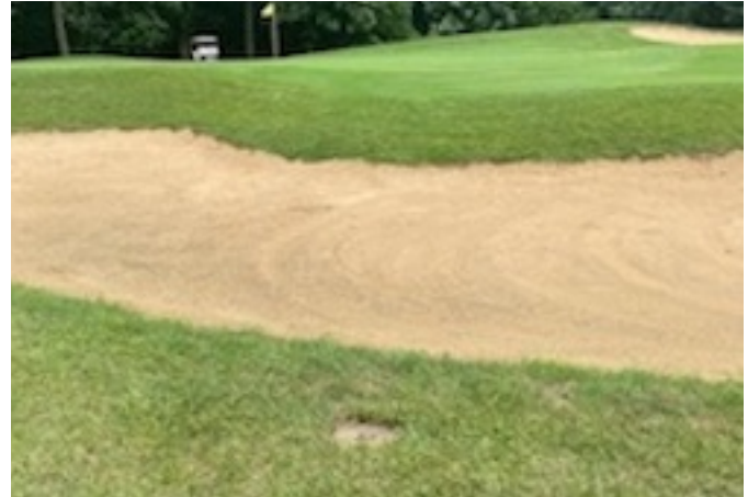
Shepherd's Stone lies just below the left sand trap on the 18th hole.