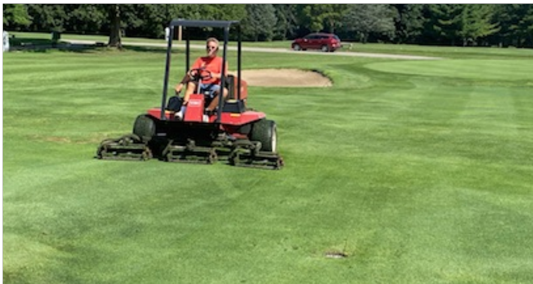
Doug Black mows on #7 fairway as part of weekly upkeep.

Several members have donated $4,825 toward the $14,000 project.