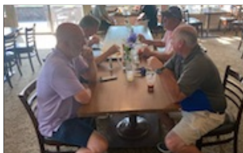
Golfers talk over breakfast July 16.